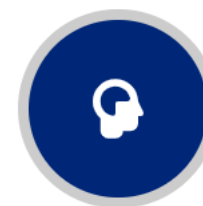
Area of Expertise